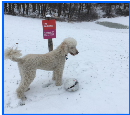
Our standard poodle, Kelby, ignoring the no dogs on soccer field sign.